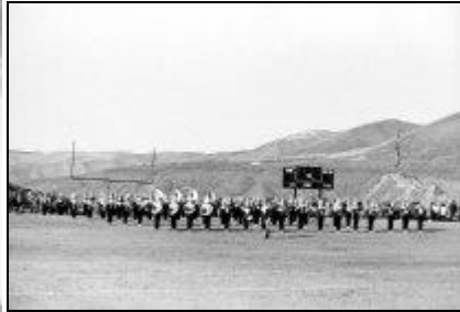
Iselin Field 1971