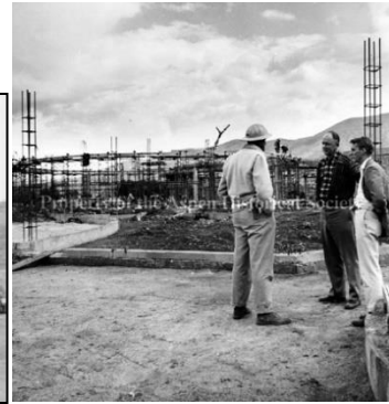
New AHS 1965